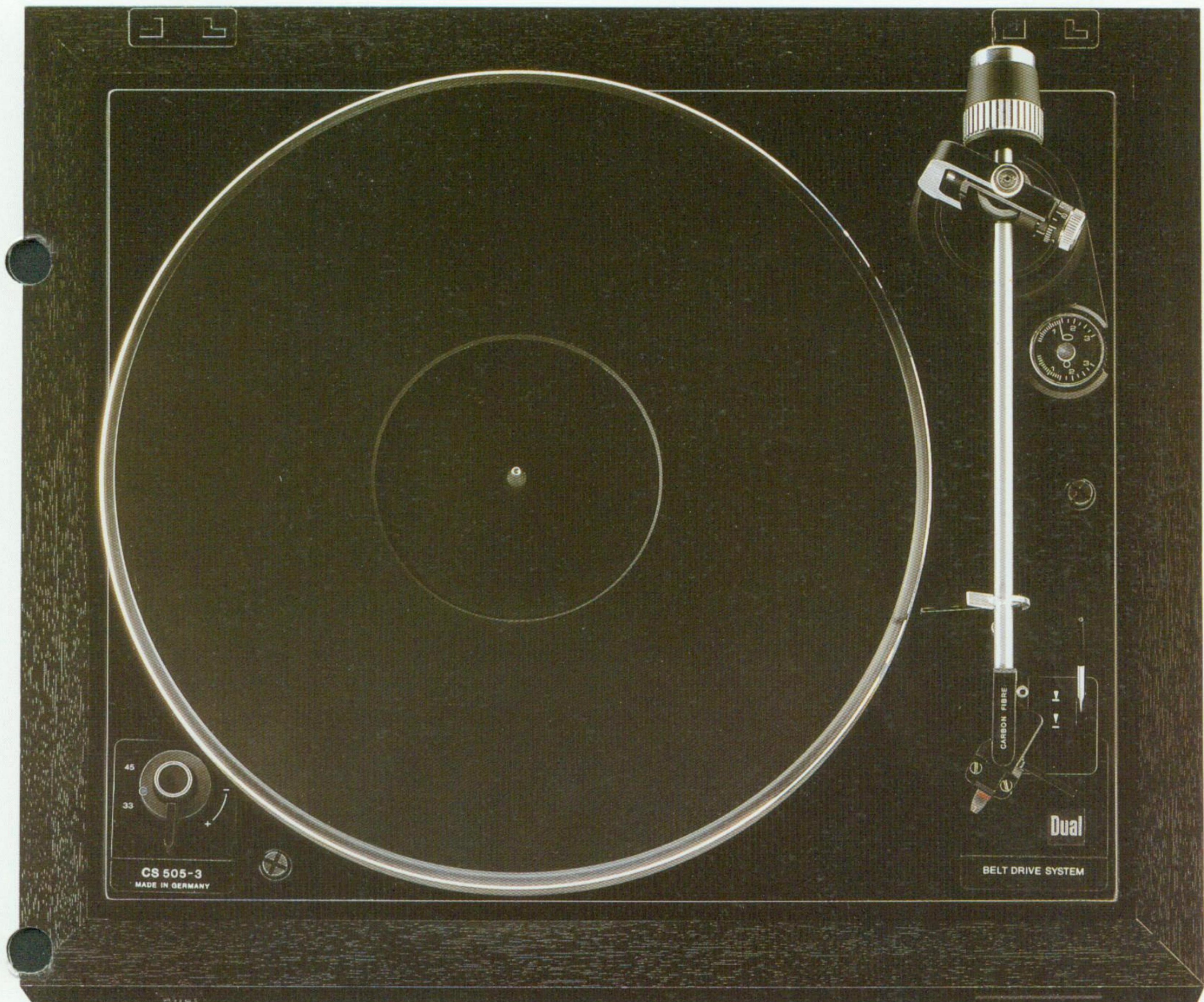
The Dual CS 505-3 turntable comes in walnut finish or black.

CS 505-3 uses a floating chassis which – together with the tonearm and the platter – is almost completely separated from the turntable casing. Only the shock-absorber feet connect the chassis with the casing. Thanks to their optimum oscillation and damping capabilities, the shock-absorbing feet eliminate both footstep noise and acoustic feedback.